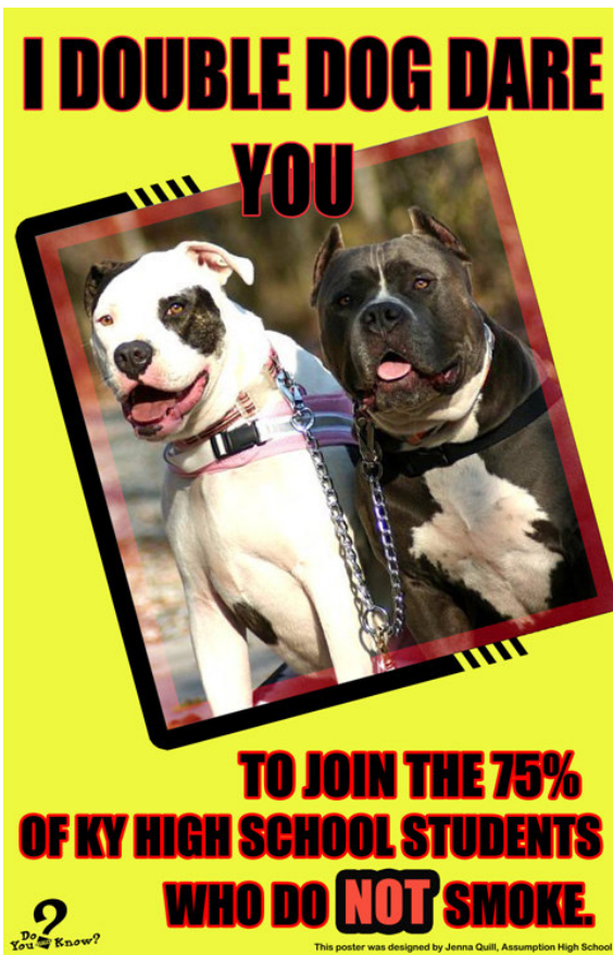
Sample Social Norms Poster

Your school is invited to participate in a smoking prevention program using positive social norms marketing, a proven strategy for changing student perceptions. Schools will be supplied with catchy posters to display the percentage of non-smokers specific to their school using BRFSS data. The goal of the program is to make a positive change in student perception about the number of students that do NOT smoke in their school. Schools will be asked to choose 8 posters to display between September 2010 and March 2011 and to conduct a short pre-test and post-test of a small student sample.